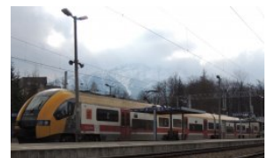
Przewozy Regionalne's train at Zakopane