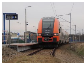
Koleje Malopolskie's train to Wieliczka salt mine