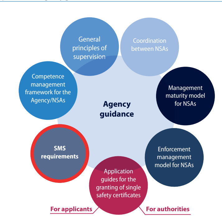
Figure 1: Compendium of Agency guidance

This document is part of the Agency compendium of guidance supporting the railway undertakings, infrastructure managers, national safety authorities and the Agency, in fulfilling their roles and undertaking their tasks in accordance with Directive (EU) 2016/798.