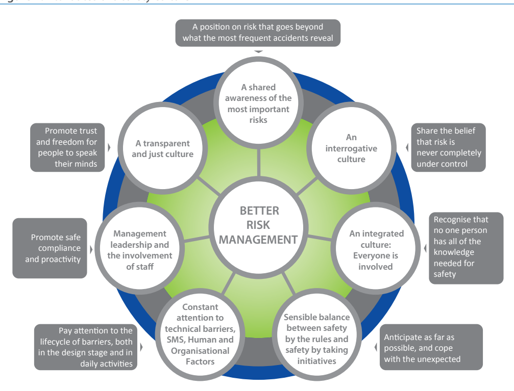
Figure 4: Attributes of a safety culture

To understand safety culture in an organisation, specialists and researchers have developed models, which usually involve a set of attributes of a positive safety culture. Figure 4 constitutes one example of such a model based on recent work of the Institute for an Industrial Safety Culture (ICSI).