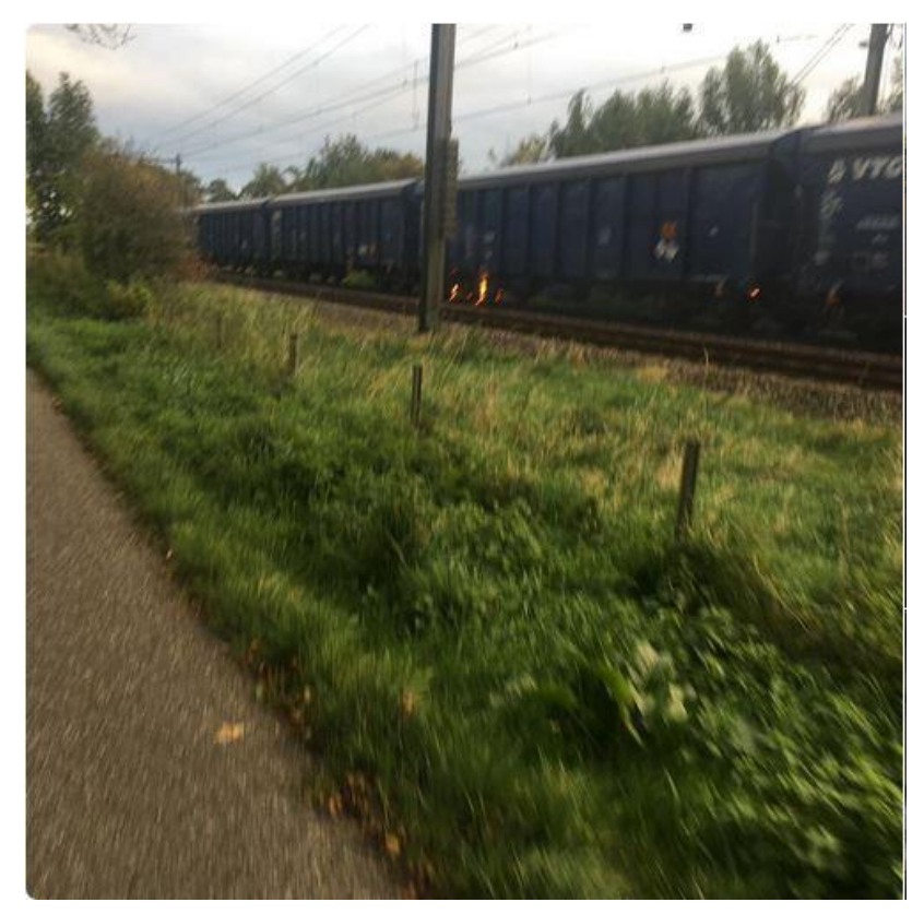
Composite brake blocks on fire (sept 2017)

This incident was reported to EU AR by ILT in February 2017. EU AR answers in September 2017 that this incident was caused by a mistake of the relevant engineer and that the regulations have sufficient measures to limit the consequences of this error.